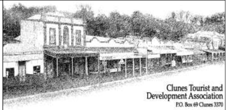
Clunes Tourist and Development Association P.O. Box 69 Clunes 3370