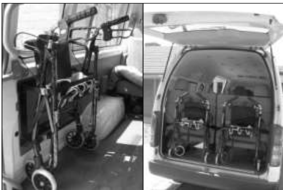
Walkers secured in bus for transport