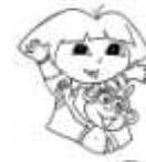
FIND THE HIDDEN WORDS

W W W M I L A Z S D D Y T R Y G W S O H P R W A J B Q O O O B Z A F R M E B K E R V G Z K A F T Y I M N O O I L U O B O X O D Q N L V W T W L I O G O R F O L C H J L S V Z R R X D V J K O E W U G E F